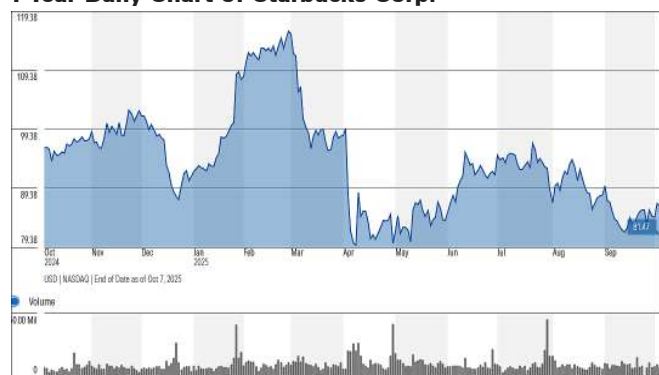
1-Year Daily Chart of Starbucks Corp.

Second in there is Medtronic that I mentioned earlier. Medtronic has a 30% to 50% market share in their main markets, in